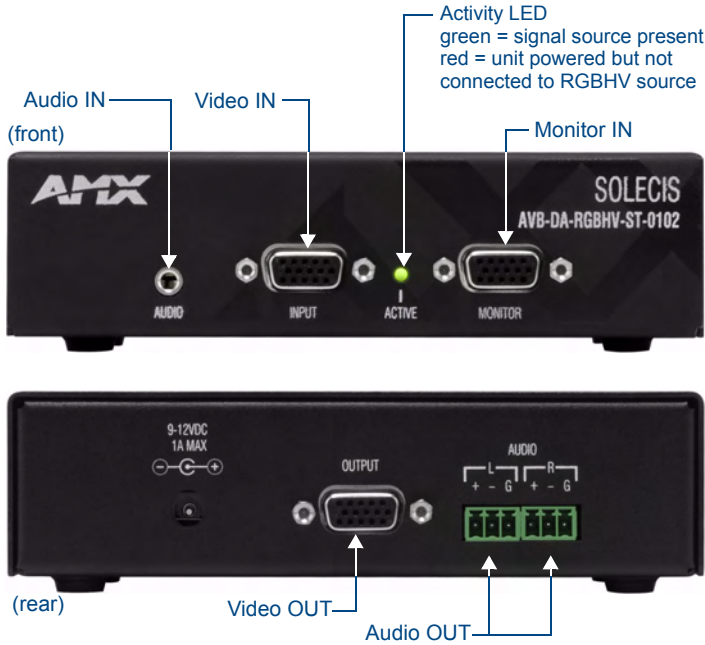
FIG. 1 Solecis AVB-DA-RGBHV-ST-0102

The AVB-DA-RGBHV-ST-0102 is capable of providing either balanced or unbalanced audio outputs.